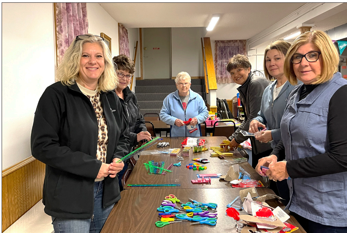
Salem WELCA creating school kits as part of their mission work.