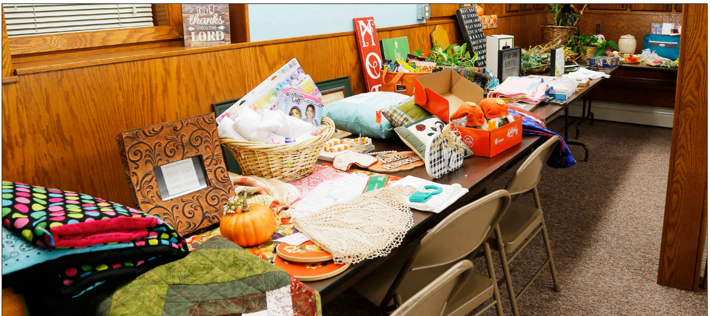
Many items were auctioned off at the Zion Auction/Bazaar in October.