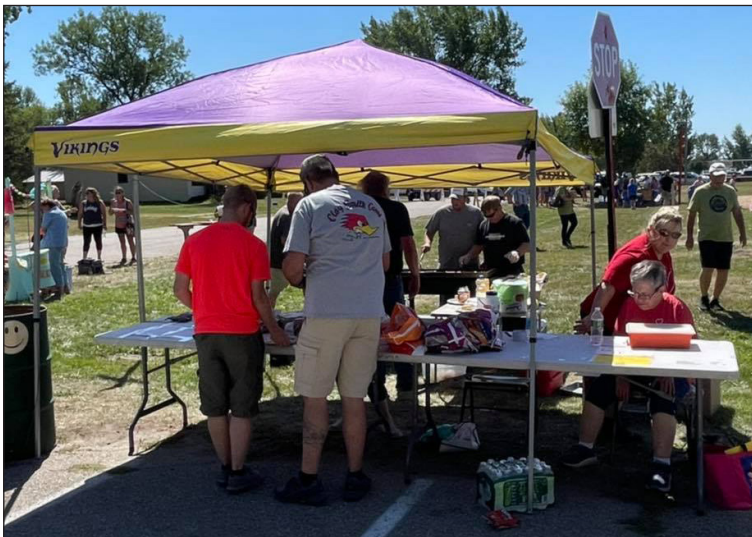
Zion Lutheran Church's Market Day booth