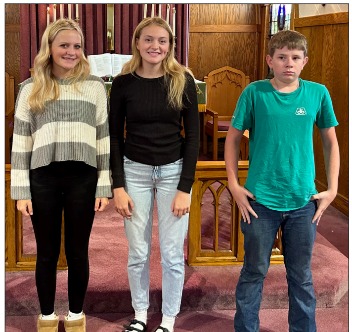
Three of the Zion kids that went on the trip told the congregation about what they liked the best at the National Youth Convention at New Orleans.