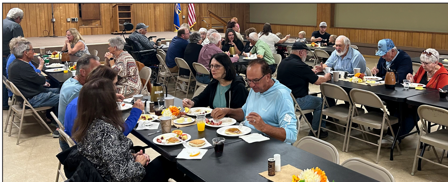
It was a delicious meal and everyone that came enjoyed the breakfast.